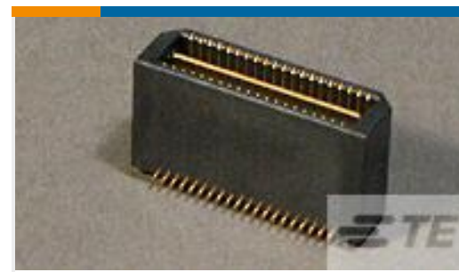
TE Part # 5-1658046-1 MSB0.80PL11ASY28DP,GP,F,VCTR