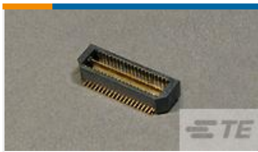
TE Part # 5-1658044-1 MSB0.80PL5ASY28DP,GP,F,VCTR