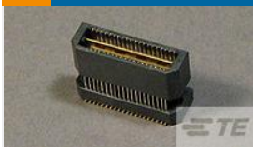
TE Part # 5-1658437-1 MSB0.80PL14ASY28DP,GP,F,VCTR