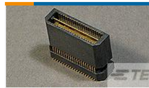
TE Part # 5-1658047-1 MSB0.80PL16ASY28DP,GP,F,VCTR