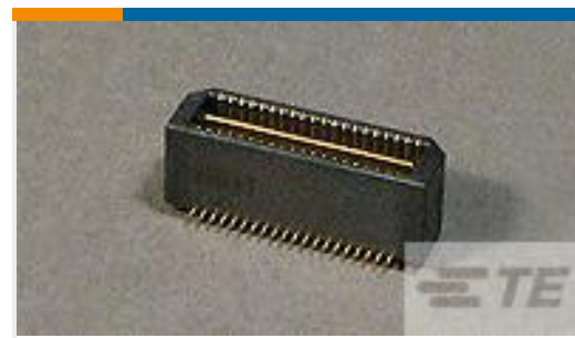
TE Part # 5-1658045-1 MSB0.80PL8ASY28DP,GP,F,VCTR